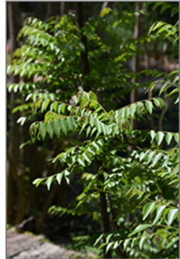
Curry Tree foliage