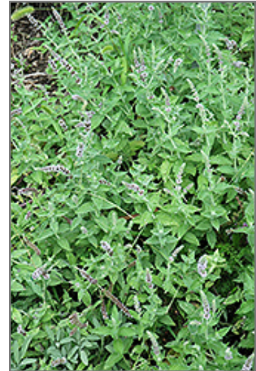
Pennyroyal in bloom

Pennyroyal is recommended for the following landscape applications;