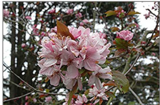
Liset Flowering Crab flowers