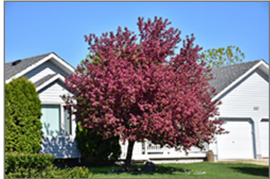
Fuchsia Girl Flowering Crab in bloom