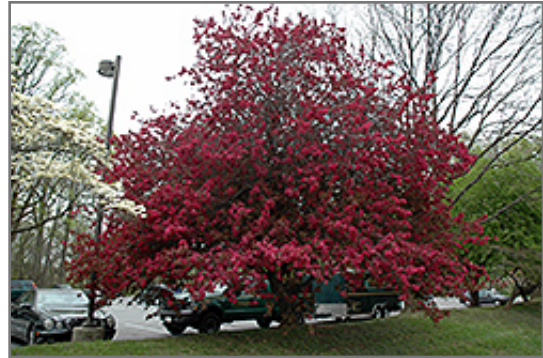
Burgundy Flowering Crab in bloom