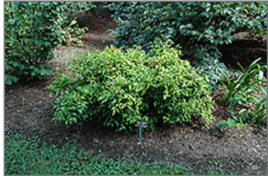
Wood's Dwarf Nandina