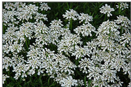
Little Gem Candytuft flowers