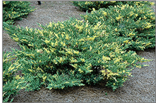
Variegated Japanese Juniper