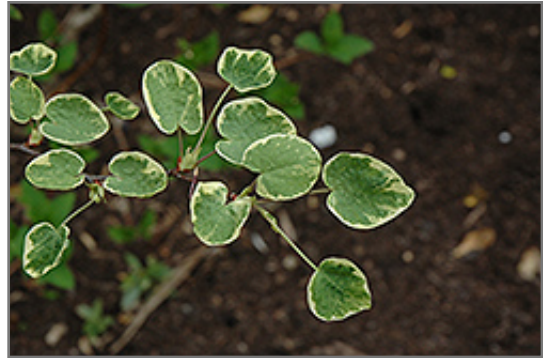
Ena Nishiki Variegated Disanthus foliage