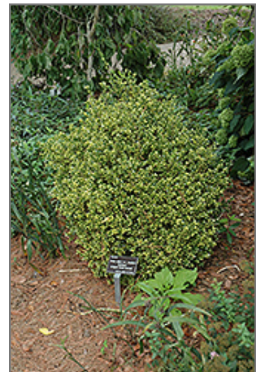
Sunburst Variegated Korean Boxwood