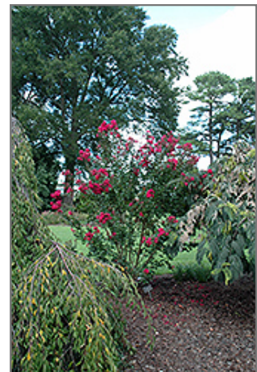
Pink Velour Crapemyrtle in bloom