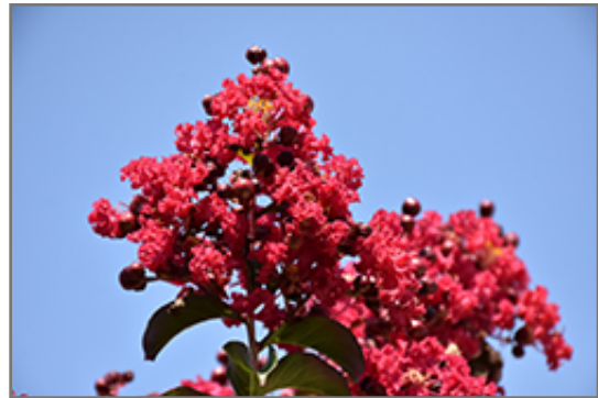
Centennial Spirit Crapemyrtle flowers