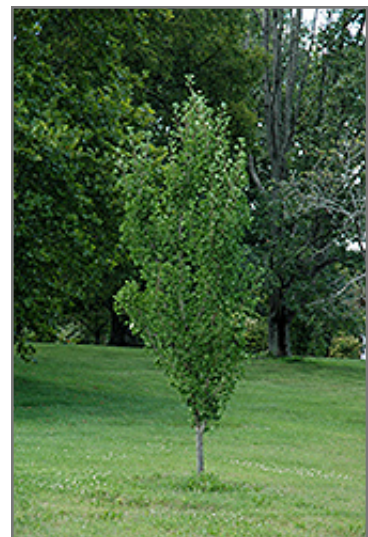
Presidential Gold Ginkgo