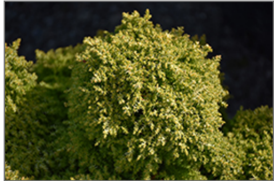
Twinkle Toes Japanese Cedar foliage