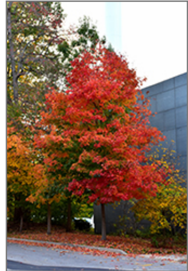
Fall Fiesta Sugar Maple in fall