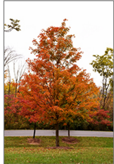
Norwegian Sunset Maple in fall