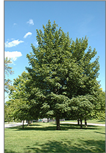
Norwegian Sunset Maple

This tree should only be grown in full sunlight. It is very adaptable to both dry and moist locations, and should do just fine under average home landscape conditions. It is not particular as to soil type or pH. It is highly tolerant of urban pollution and will even thrive in inner city environments. This particular variety is an interspecific hybrid.