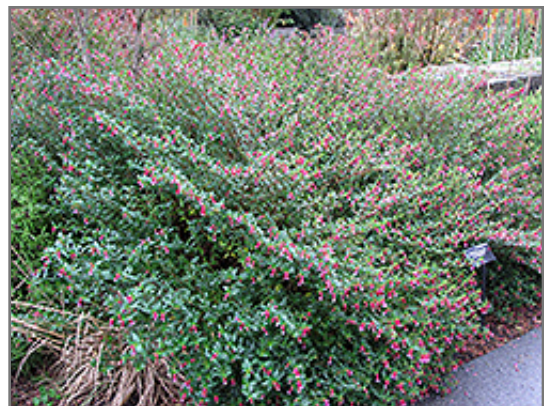
Starfire Pink Firecracker Plant in bloom