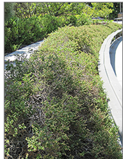
Pigeon Point Coyote Brush