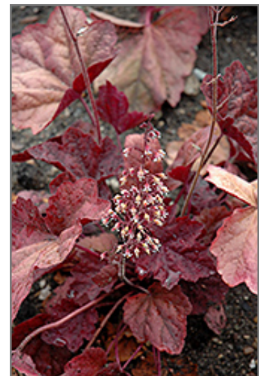
Lava Lamp Coral Bells flowers