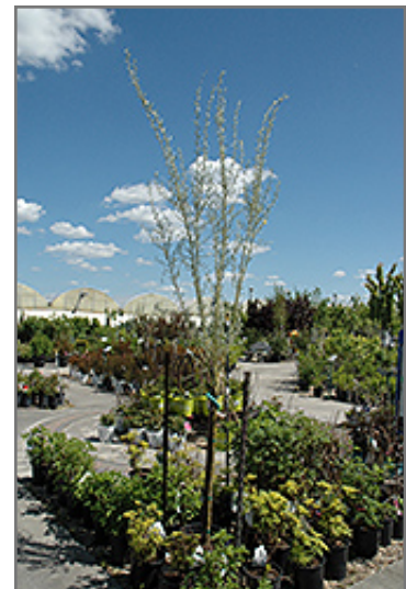
Mongolian Silver Spires Littleleaf Peashrub