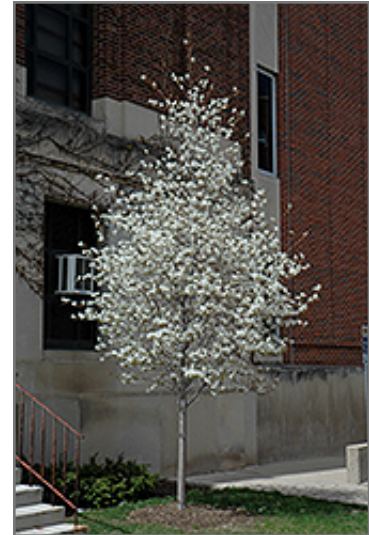
Spring Flurry Serviceberry in bloom