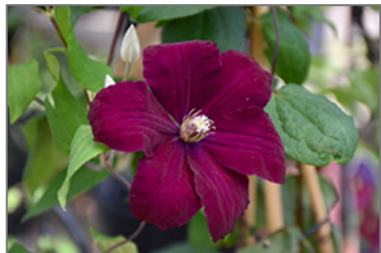
Rouge Cardinal Clematis flowers