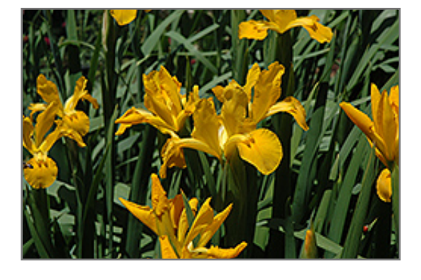
Missouri Orange Iris flowers