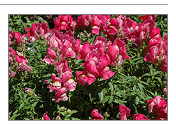
Trailing Snapshot Rose Snapdragon flowers