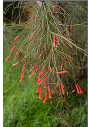
Firecracker Plant flowers