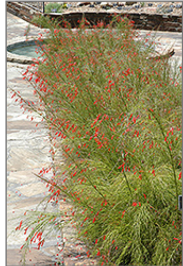
Firecracker Plant in bloom

Firecracker Plant is a fine choice for the garden, but it is also a good selection for planting in outdoor containers and hanging baskets. Because of its height, it is often used as a 'thriller' in the 'spiller-thriller-filler' container combination; plant it near the center of the pot, surrounded by smaller plants and those that spill over the edges. It is even sizeable enough that it can be grown alone in a suitable container. Note that when growing plants in outdoor containers and baskets, they may require more frequent waterings than they would in the yard or garden.