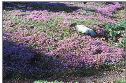
Mother-of-Thyme in bloom