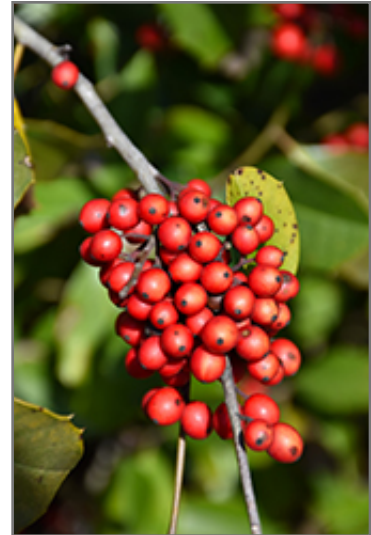
Savannah Holly fruit