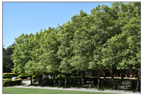
Savannah Holly