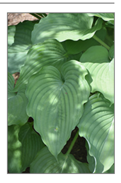
Komodo Dragon Hosta foliage

Komodo Dragon Hosta is recommended for the following landscape applications;