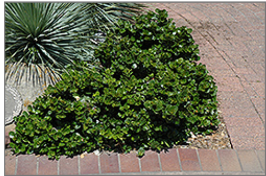
Tuttle's Natal Plum

Aside from its primary use as an edible, Tuttle's Natal Plum is suitable for the following landscape applications;