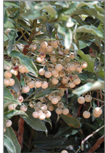
White Coral Berry fruit