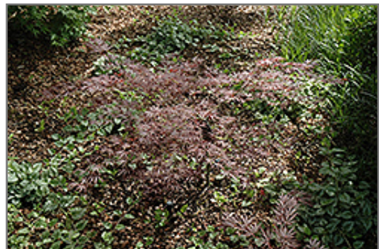
Sherwood Elfin Japanese Maple