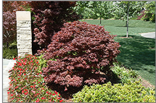
Rhode Island Red Japanese Maple