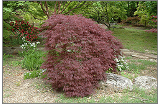
Red Filigree Lace Japanese Maple

Red Filigree Lace Japanese Maple is recommended for the following landscape applications;