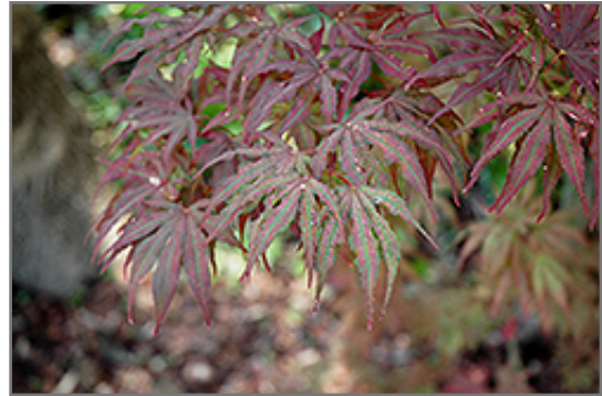
Mikazuki Japanese Maple foliage