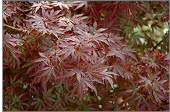
Aratama Japanese Maple foliage