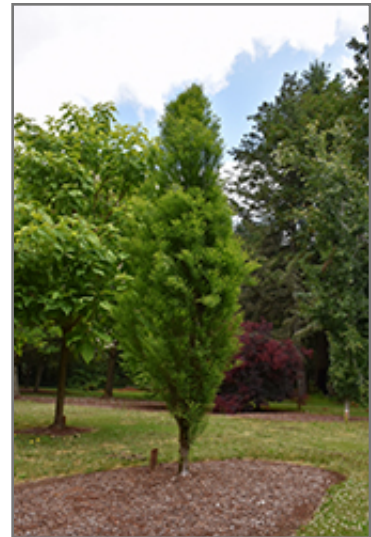
Lindsey's Skyward Bald Cypress