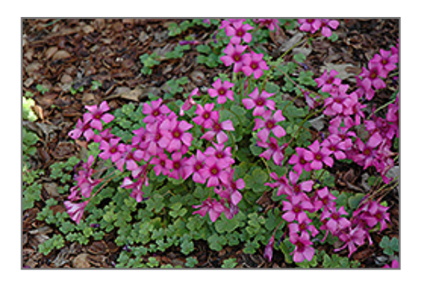
Wood Sorrel flowers