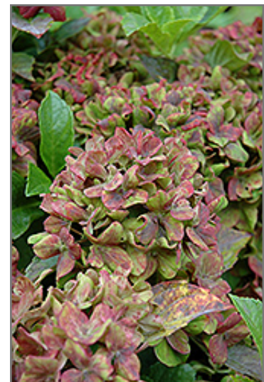
Pistachio Hydrangea flowers