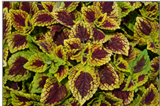
Stained Glassworks Raspberry Tart Coleus foliage