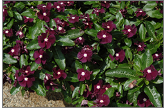
Jams 'N Jellies Blackberry Vinca flowers

Jams 'N Jellies Blackberry Vinca is recommended for the following landscape applications;