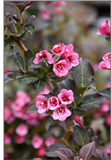
Tango Weigela flowers