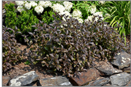
Tango Weigela

This shrub should only be grown in full sunlight. It prefers to grow in average to moist conditions, and shouldn't be allowed to dry out. It is not particular as to soil type or pH. It is highly tolerant of urban pollution and will even thrive in inner city environments. This is a selected variety of a species not originally from North America.