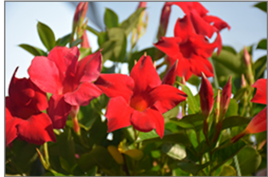
Sun Parasol Crimson Mandevilla flowers

This plant is native to the tropics and prefers growing in moist environments with evenly warm conditions all year round. In our climate, it is usually grown as an outdoor annual in the garden or in a container. If you want it to survive the winter, it can be brought in to the house and provided with special care, and then returned to the garden the following season. In its preferred tropical habitat, it can grow to be around 10 feet tall at maturity, with a spread of 24 inches. However, when grown as an annual or when overwintered indoors, it can be expected to perform differently, and its exact height and spread will depend on many factors; you may wish to consult with our experts as to how it might perform in your specific application and growing conditions.