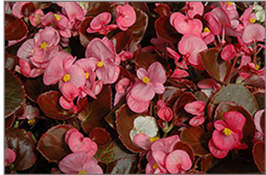
Nightife Rose Begonia flowers

Nightife Rose Begonia is recommended for the following landscape applications;