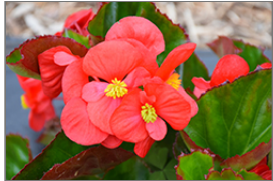
Big Red Green Leaf Begonia flowers

Big Red Green Leaf Begonia is recommended for the following landscape applications;