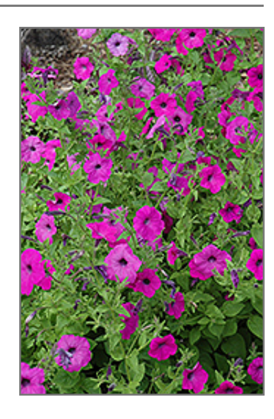
Laura Bush Petunia flowers

Laura Bush Petunia will grow to be about 18 inches tall at maturity, with a spread of 30 inches. When grown in masses or used as a bedding plant, individual plants should be spaced approximately 24 inches apart. Its foliage tends to remain dense right to the ground, not requiring facer plants in front. This fast-growing annual will normally live for one full growing season, needing replacement the following year.