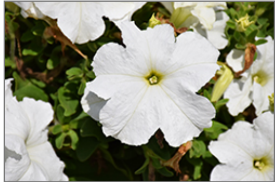
EZ Rider White Petunia flowers