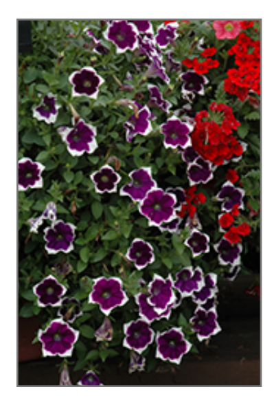
Cascadias Rim Violet Petunia flowers