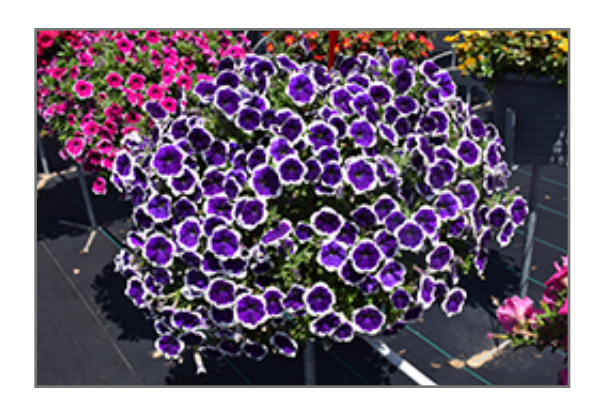
Cascadias Rim Violet Petunia in bloom

2608 Hikes Lane Louisville, KY, 40218 phone: 502-454-3553 www.wallitsch.net