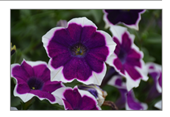
Cascadias Rim Violet Petunia flowers