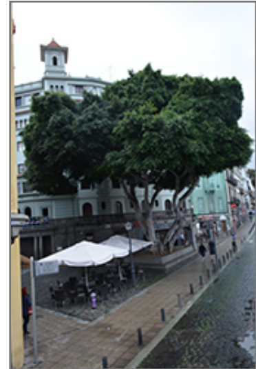
Indian Laurel Fig

Indian Laurel Fig is recommended for the following landscape applications;