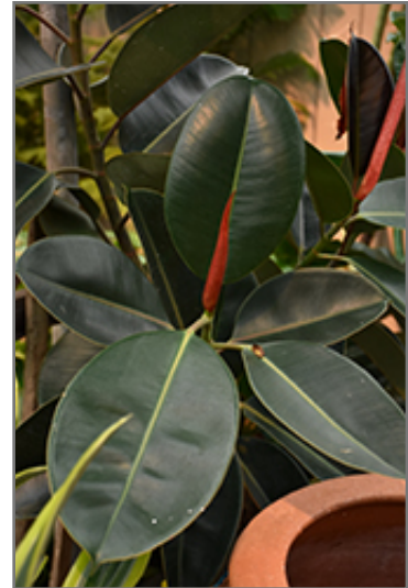
Rubber Tree foliage