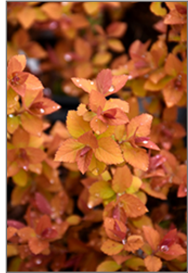
Double Play Big Bang Spirea foliage

This shrub should only be grown in full sunlight. It prefers to grow in average to moist conditions, and shouldn't be allowed to dry out. It is not particular as to soil type or pH. It is highly tolerant of urban pollution and will even thrive in inner city environments. This particular variety is an interspecific hybrid.